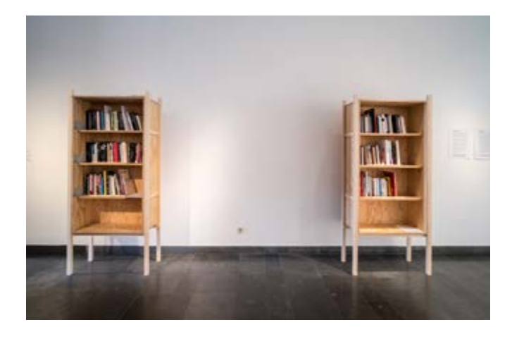
documenta 14, Kassel, Germany, 2017

curators: Adam Szymczyk and Pierre Bal-Blanc